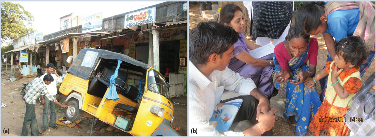
Figure 1. The Spoken Web is a hyperlinked information service that is voice- rather than text-driven. (a) An auto mechanic uploads an advertisement for his services to a VoiceSite. (b) A group of rural citizens collaboratively browse the Spoken Web.

people in India are using the Spoken-Web as a platform to show off their singing talent and send voice greetings to one another (S.K. Agarwal et al., “User-Generated Content Creation and Dissemination in Rural Areas,” Information Technologies & Int’l Development , vol. 6, no. 2, 2010, pp. 21-37).