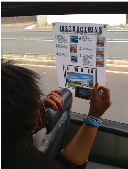
Figure 2. The Big Board system lets mobile phone users freely access content by taking photos of images on stickers applied to the inside of public transportation vehicles.

Initial Big Board trials in various communities around Cape Town were successful but raised cost concerns: large LCD displays and computers to drive them aren't cheap. The system also needs a constant source of electricity, further limiting its deployment in developing regions.