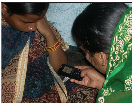
Figure 3. Two women in rural India view a maternal health information video displayed on a mobile phone.

In addition to the technical shortcomings, researchers determined that it was prohibitively difficult for many target users to travel to the buildings in which the screens were installed. For Big Board to be truly invisible,