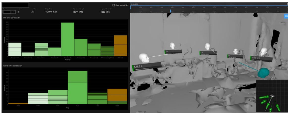
Figure 2: The bespoke software used to assess engagement with the PeopleLens curriculum.

with blindness. For example, the question ‘Does the learner play with others?’ was adjusted to ‘Is the learner interested in playing with others when s/he has the chance?’ In some cases, children with blindness do not have opportunity to play with others even if they want to.